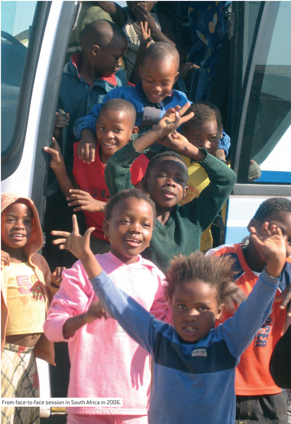
From face-to-face session in South Africa in 2006.