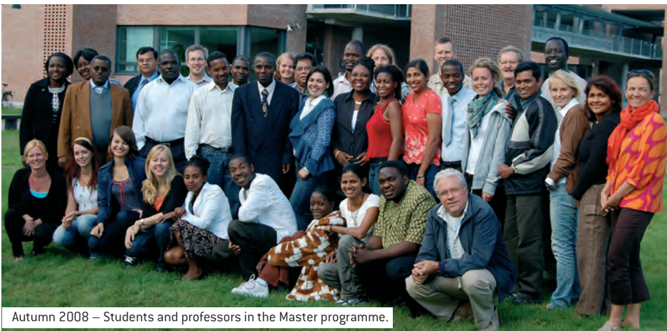
Autumn 2008 – Students and professors in the Master programme.

There are a total of 12 available scholarships for each batch of students. These scholarships are distributed between the partner universities. Only applicants from the partner universities can apply for NOMA scholarships. The NOMA scholarship will cover a monthly allowance, tuition fee, travel expenses, food and lodging in connection with face-to-face sessions, curriculum and a laptop. All applications from Tanzania, Uganda, Ghana, Ethiopia and Sri Lanka must be sent to the involved universities.